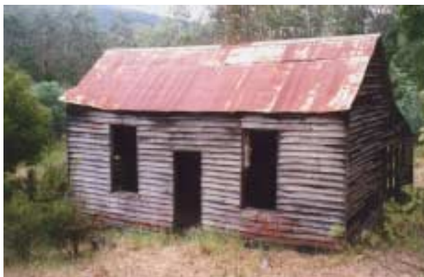
Camm's Top Hut