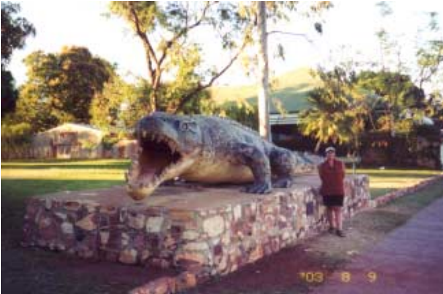
Even with Liz's judo credentials, this boy would be just too big to tackle!

Next is a visit to see Krys, the 28'4" crocodile. He is huge and to think he was shot by a female.