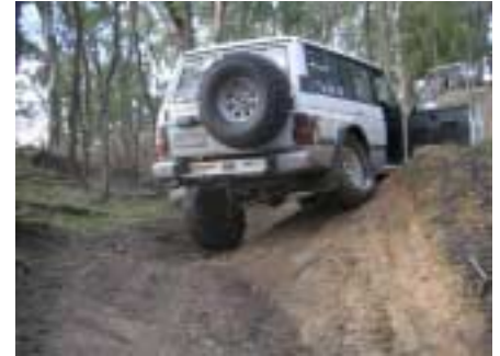
Marysville - June 2004 Toolangi - July 2004