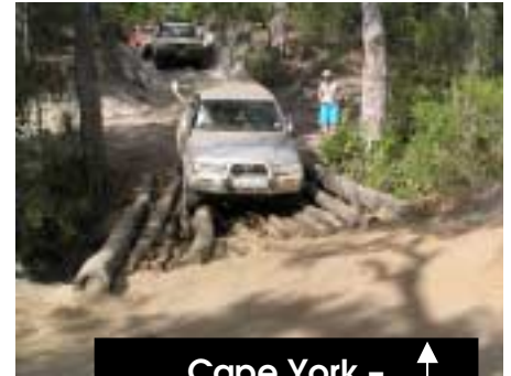
Cape York - August 2004