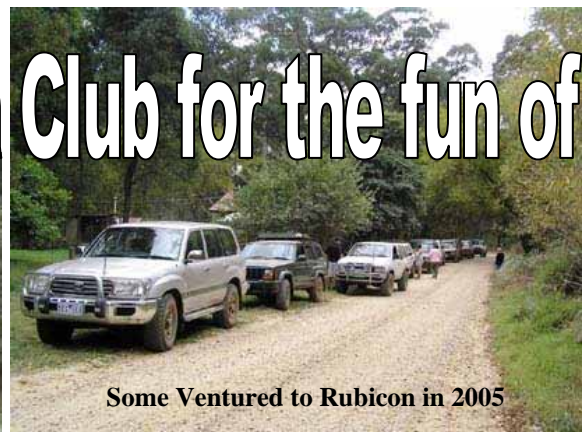
Some Ventured to Rubicon in 2005