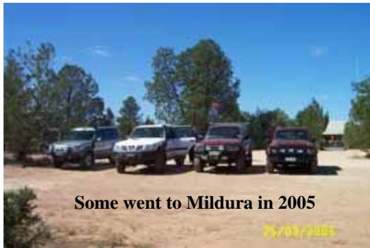
Some went to Mildura in 2005