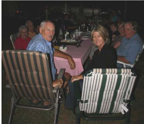
Smile for the birdie everyone...

exquisite and a credit to those who provided. The evening continued with many laughs and stories concerning flames and camping equipment. Not to mention a couple of glasses of wine, after all it was a wine trip.