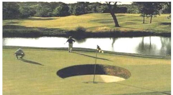
Golf for beginners...

To keep non members out of the group, your membership will need to be approved.