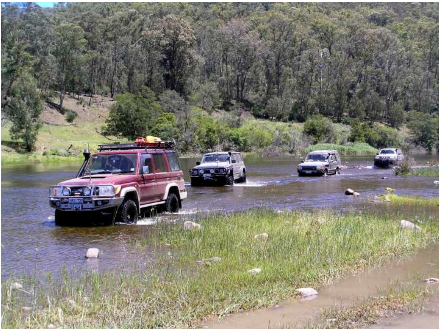
Jacksons Crossing during the Xmas trip to McKillop's Bridge