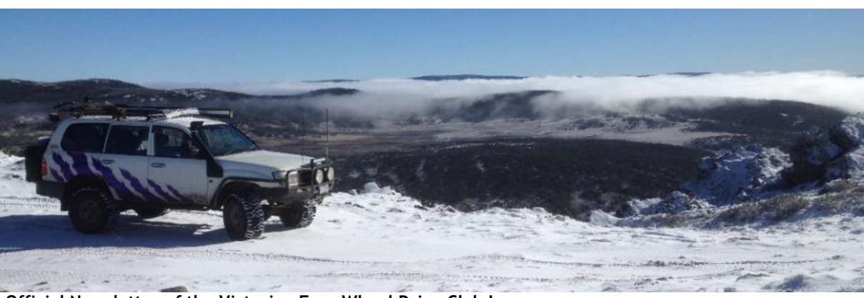
Official Newsletter of the Victorian Four Wheel Drive Club Inc

We stopped in at Horseyard Hut / Flat just in time for lunch and then we made our