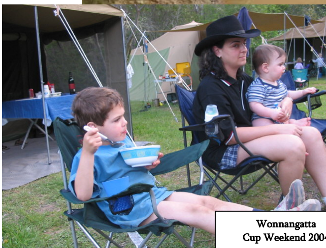
Wonnangatta Cup Weekend 2004