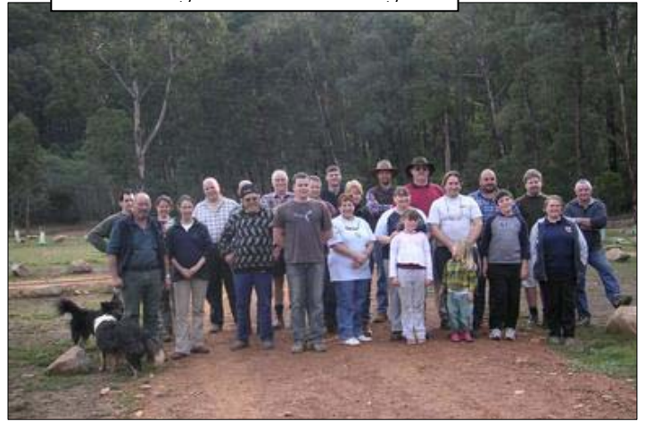
Merringtons Camping Ground Working Bee & Tree Planting