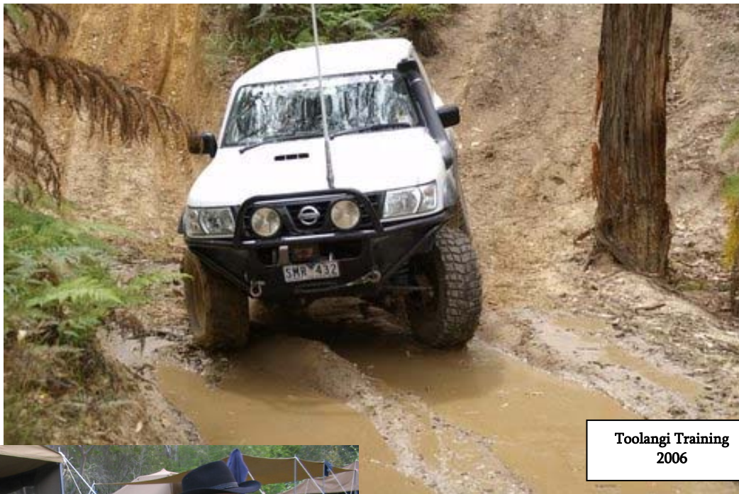
Toolangi Training 2006