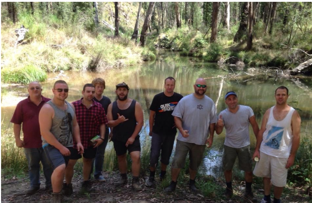
The boys, Doing what boys do best