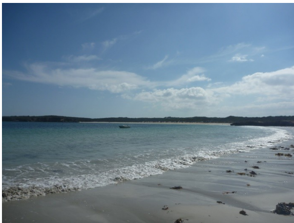
The bay at Nora Creina.

We had a great mix of beach driving and then driving in the dunes for the day. There were a couple of times when people got stuck but nothing that a quick snatch or a set of maxtraxs couldn't solve. We had lunch in Nora Crieda before heading into Little Dip National Park for the afternoon's driving.