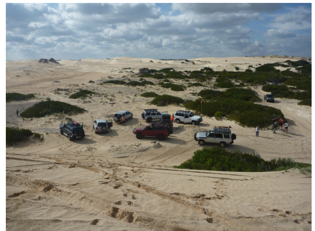
Our new group of friends for the day!

We started off the drive and soon found some dunes to play in and we all had a go at getting up. Our tyre pressures were way too high so we had to keep reducing them down to lows of 12psi. We had fun in the Disco with traction control kicking in at the wrong times.