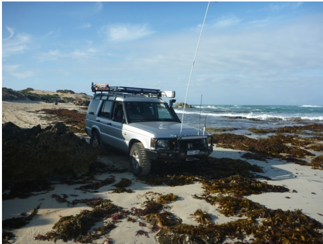
Tristan negotiating the first Beach drive.

The next morning we awoke to sunshine and a stunning day so off we went leaving our German friends for the next leg of their adventure. We decided that we were going to head to Robe. The Maps are pretty good but we soon found out that it was going to be an interesting day as we kept going down tracks to see if we could drive on the beach or trying to work out how it all worked. I did a lot of walking. It was great fun though but as we only had 2 vehicles and the sand is quite soft we were taking it easy. The main channel on the radios here is 10 so we had one radio tuned to that and then another on our own channel. Tristan picked up a group heading our way and they had a Disco leading the group. They were giving the Disco a hard time and Tristan could not help himself and made comments to about how great they were. We then worked out that they were only just behind us so Tristan invited us to join their group. They were very obliging. They were the Naracoorte Four Wheel Drive Club and friends. We joined their group at the back and we were now under the guidance of Danny and his Disco 3 and the President of the Club as Tail End Charlie.