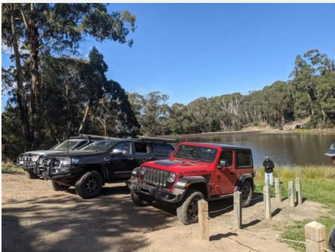
Lunch at the Trawool Reservoir

Great day trip out to Tallarook State Park. Got some climbs done, a bit of mud and the odd U-turn. Great easy/medium day out with a sprinkle of almost 4 o'clock track.