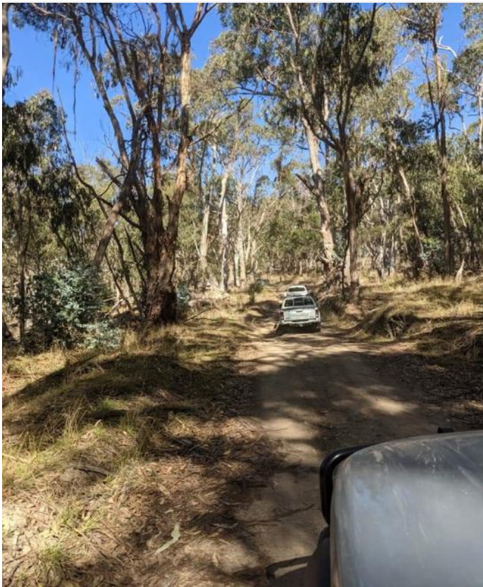
Climbing East Falls Road