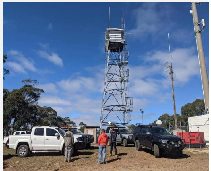
Morning Tea at Mt Hickey