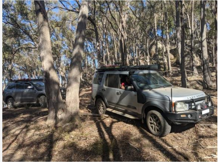
This may have been the site of a U-turn