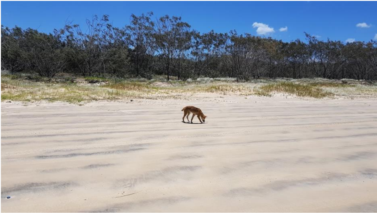
We spotted a dingo on Fraser