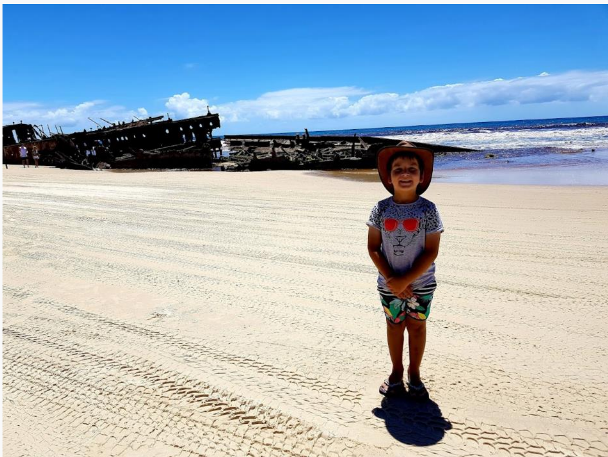
The wreck SS Maheno was amazing to see.