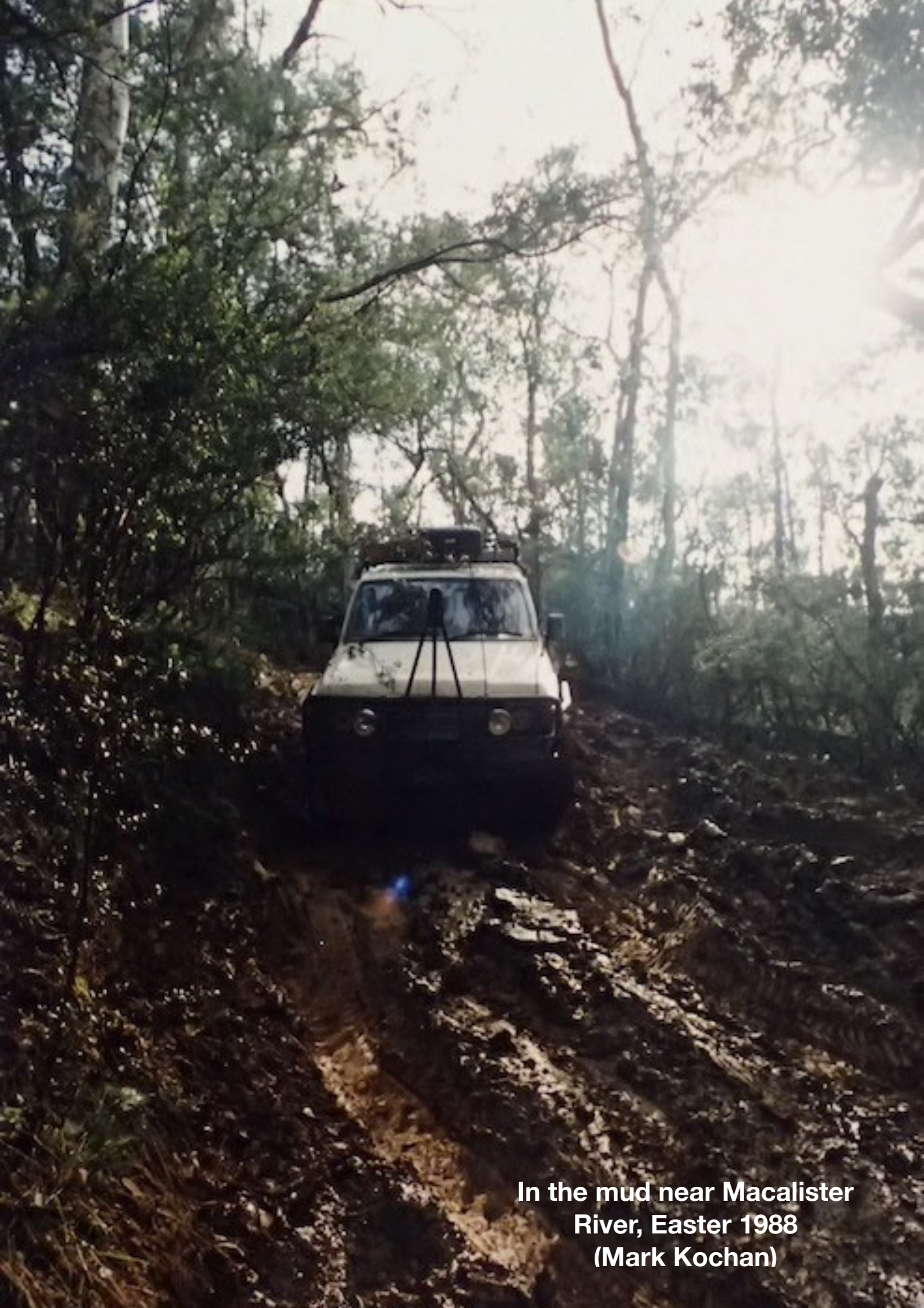
In the mud near Macalister River, Easter 1988