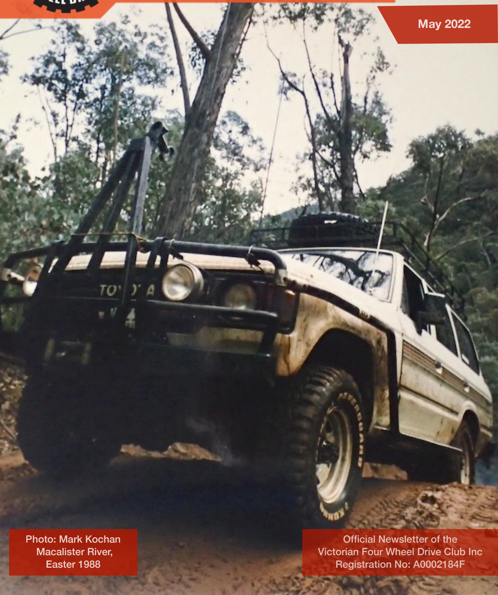
Macalister River, Easter 1988

Official Newsletter of the Victorian Four Wheel Drive Club Inc Registration No: A0002184F